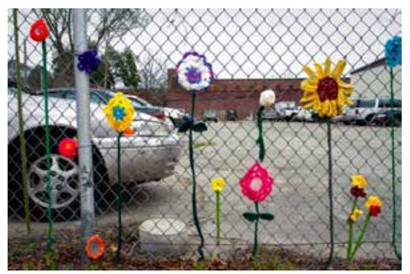
"Crochet Fence" by the Youth Public Arts Project and Community Former Location: Dickinson Ave.

Scholarships are offered to underprivileged children in our community to attend classes and workshops free of charge.