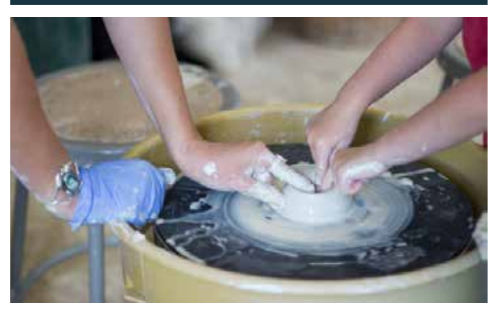
Sunday, September 24th 1:30pm until 3:30pm (Children Ages 3+ and an Adult)

Participants will learn the basics of working on the potter's wheel. They will learn to wedge, center, and pull the clay to make a simple form. Participants will choose 1 or 2 of their best attempts to be glazed with a beautiful blue.